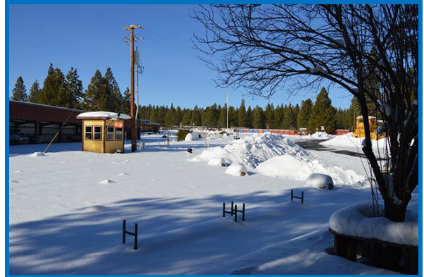
Central Station did NOT get plowed!