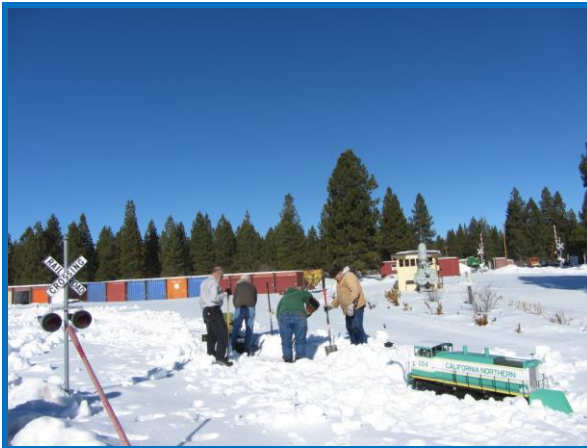
The Motley Crew!