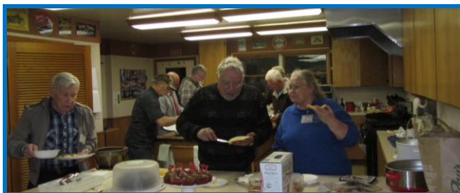
Dinner is served and boy oh boy was it good!