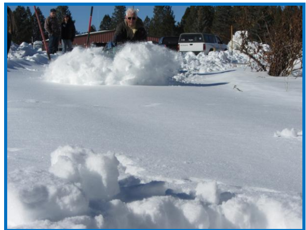
A very carefully timed shot showing Larry hitting it!