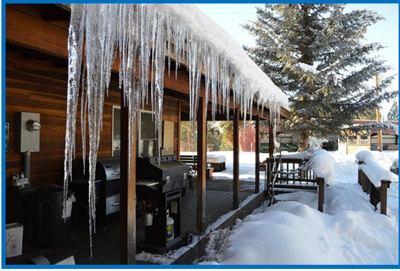
So how cold was it? Take a look!