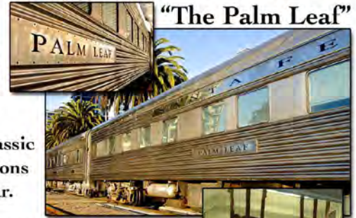
"The Palm Leaf"

Each night, you will sleep in classic comfort aboard the accommodations of the "Palm Leaf" sleeper car.