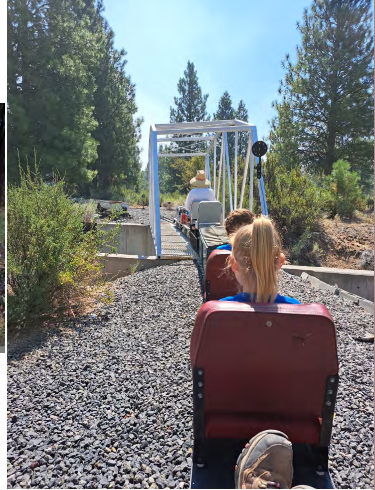
Photo at right taken by Bonnye Spray during the Chiloquin Fire & Rescue Annual Picnic

Register or Joinhttps://trainmtn.org/tmrrmembers/Member_Portal.aspxThe Mountain GazettePage:6August 2023