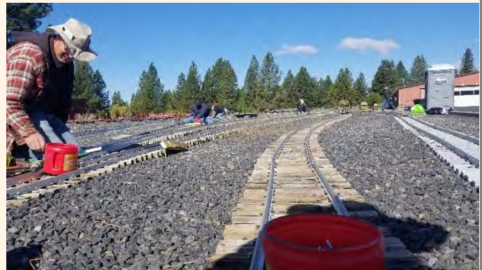
Screw the Yard