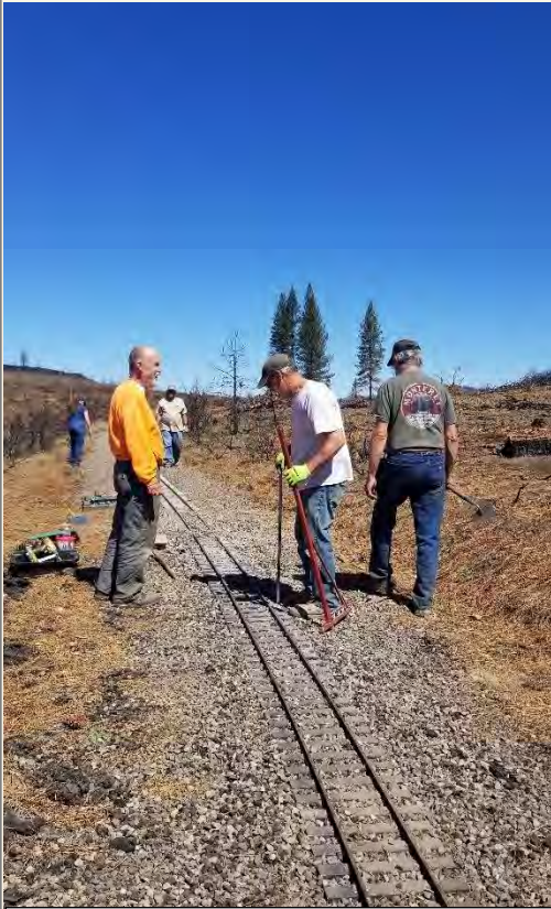
North end fire cleanup