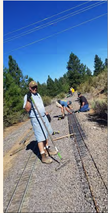
The Crew in 2020

Then 2020 hit and the world stopped... No trains, no seeing friends, no nothing. I spent more time in my shop building train parts than I can remember. At some point Train Mountain had opened to members with outside access only and off we went. I was able to work remotely and since the kids were attending school remotely, we were set. This year is when the roots of The Wonder Bread Crew started. A few other members had the same idea and were also hiding out at Train Mountain. We were all craving something to do that would feel something approaching normal. Dale and I and a few others started unplanned work and maintenance around the railroad to keep us busy. The original crew I think numbered around five or six volunteers. If you haven't noticed there is not a shortage of roots or work that needs to be done at Train Mountain so we stayed plenty busy. It gave us all something to do and a place to be with a loose schedule. It gave us a sense of normalcy.